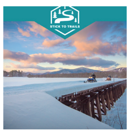
Prevent injury and reduce damage to landscapes by sticking to snow packed trails. To learn more about the other Leave No trace Principles NHLeaveNoTrace.com.