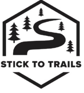
Best for Winter use