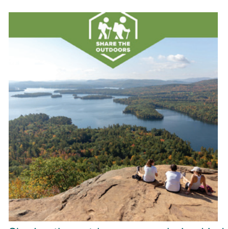
Sharing the outdoors means being kind and respectful to everyone you meet in NH's great outdoors. To learn more about the other Leave No trace Principles NHLeaveNoTrace.com.