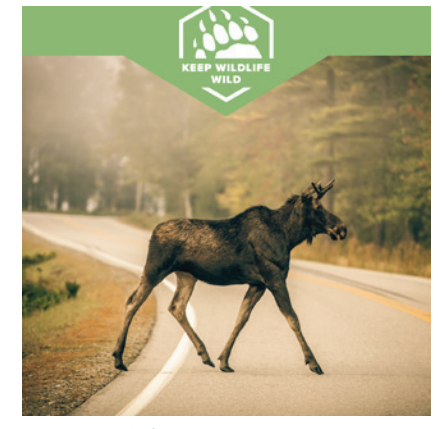
Leave wildlife wild by observing at a distance, refraining from feeding, and always store food securely. To learn more about the other Leave No trace Principles NHLeaveNoTrace.com.