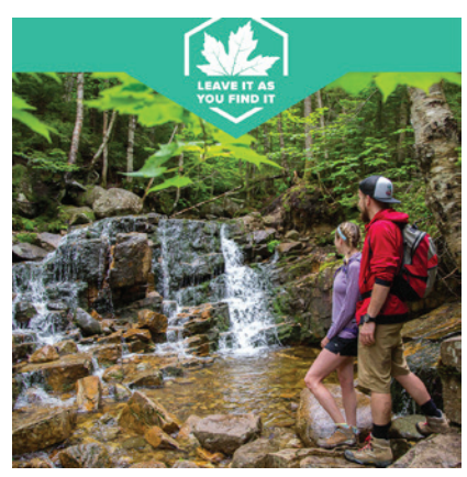
Leave nature where you found to help preserve NH. To learn more about the other Leave No trace Principles NHLeaveNoTrace. com.