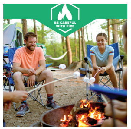
Be careful with fire by burning local firewood and always extinguish fires completely. To learn more about the other Leave No trace Principles NHLeaveNoTrace.com.