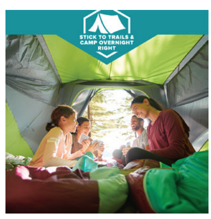
Prevent injury and reduce damage to landscapes by sticking to trails. To learn more about the other Leave No trace Principles NHLeaveNoTrace.com.