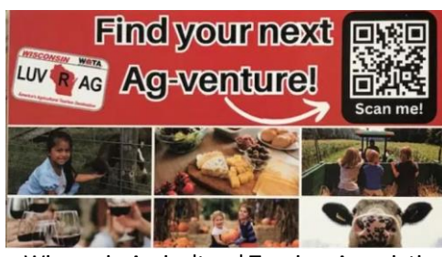
Wisconsin Agricultural Tourism Association

The WATA is a non-profit organization that promotes agritourism in Wisconsin. The association provides resources and support to farmers who